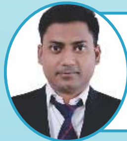
■ NITISH KUMAR