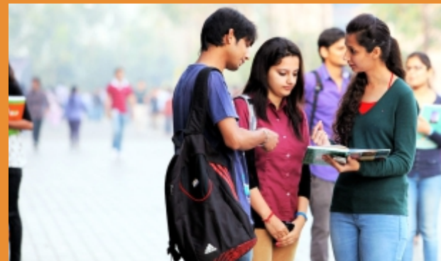
PEDAGOGY – B. TECH, BBA, MBA AND DIPLOMA

We focus on development of relevant skills (S), correct attitude (A) and contextual knowledge (K) across the widest cross-section of student population. Besides, equipping the students with the desired SAK matrix, we also emphasize on holistic development of each student so that he/she becomes an alert and responsible citizen of the country.