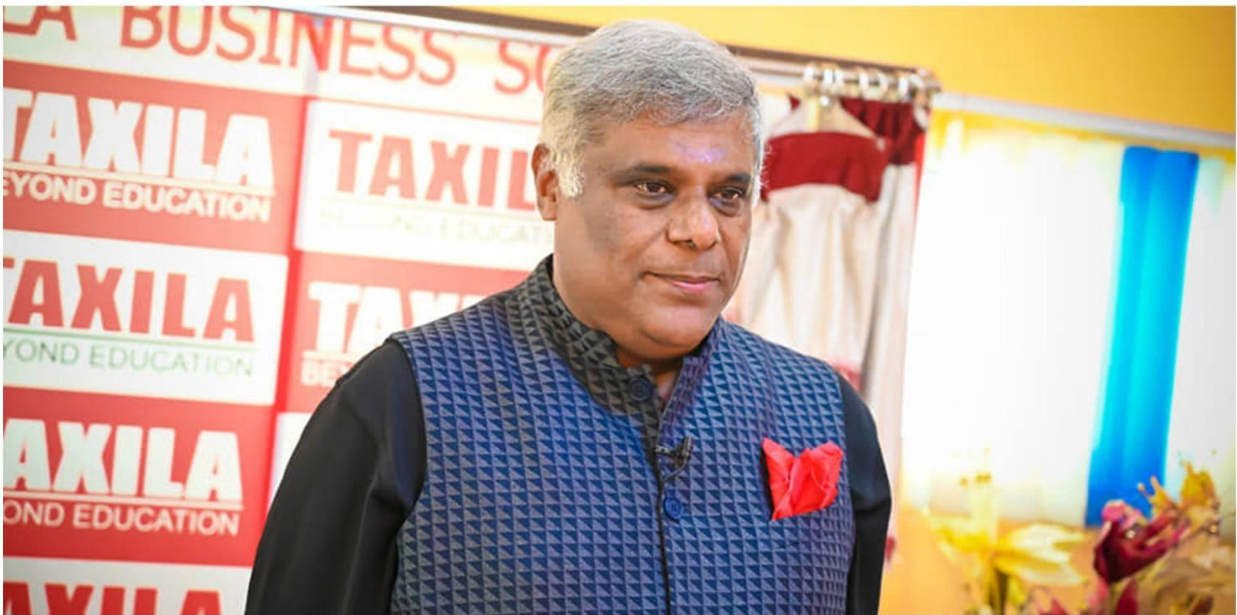
Mr. Ashish Vidyarthi

Ashish Vidyarthi. Ashish Vidyarthi (born 19 June 1962) is an Indian film actor and motivational speaker, known for his work in 11 different languages, predominantly in Hindi, Tamil, Kannada, Malayalam, Telugu, Bengali, English, Odia and Marathi cinema. He is noted for his antagonist and character roles.