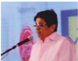
Dr. Kiran Bedi – Hon'ble Lt. Governor of Puducherry