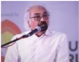
Sam Pitroda – Father of Indian Telecom Revolution