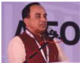
Dr. Subramanian Swamy Member of Parliament, Rajya Sabha