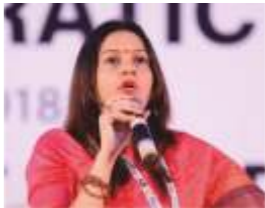
Ms. Priyanka Chaturvedi National Spokesperson, Indian National Congress