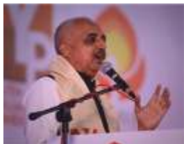
Shri Akhilesh Pratap Singh National Media Panellist, Indian National Congress