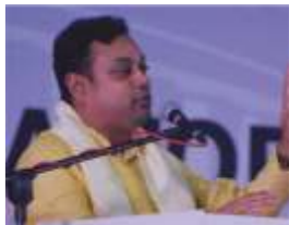
Dr. Sambit Patra National Spokesperson, Bharatiya Janata Party