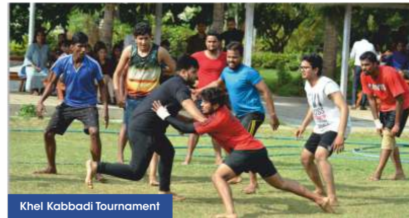
Khel Kabbadi Tournament