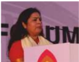
Smt. Meenakshi Lekhi Member of Parliament, Lok Sabha