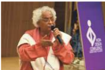
Rajeev Sethi – Designer, Scenographer and Art Curator

Disclaimer: All Designations are in context to July 2018