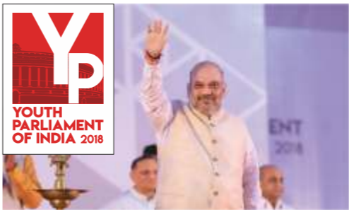
Shri Amit Shah – National President, Bharatiya Janata Party

Disclaimer: All Designations are in context to July 2018