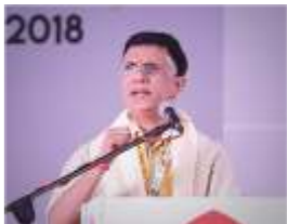
Shri Pawan Khera Senior Leader, Indian National Congress