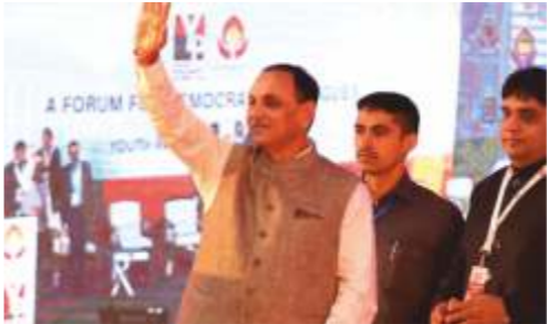
Shri Vijay Rupani Hon'ble Chief Minister, Gujarat