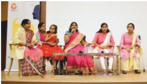
Sampat Pal, Founder and Leader, Gulabi Gang along with her team