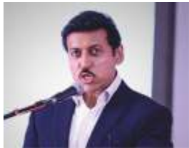
Col. Rajyavardhan Singh Rathore, VSM (Retd.), Hon'ble Minister of State (I/C) for Youth Affairs & Sports and Information & Broadcasting, Govt. of India